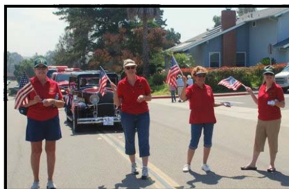
Members of the Scripps Ranch FSC march in their community 4th of July Parade.

The Los Tules FSC hosted their 1st Annual Community Chipping Event where approximately 20 school bus size piles of materials were chipped!