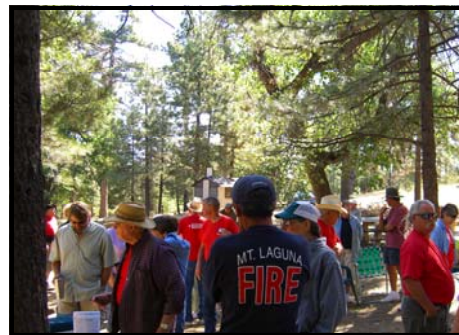
The Mt. Laguna FSC Newcomers Orientation and Community Picnic was a great event of food, fun, and funds raised for an active FSC!

Fundraising possibilities are only limited by the imagination. Since summer is upon us, consider getting outdoors to host a community picnic or potluck. The Mt. Laguna Fire Safe Council (FSC) recently hosted a “Newcomers Orientation” to provide resources and information for new cabin owners to understand what's involved in maintaining their cabin (right). The orientation was followed by a picnic where a 50/50 drawing was held with half of the money raised going to the Mt. Laguna FSC