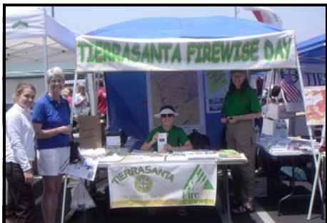
The Tierrasanta FSC shared information about fire safety with attendees of the Tierrasanta Craft Fair.

We would like to welcome Los Tules FSC, Talmadge FSC, and Campo/ Lake Morena FSC as Associate Member Community Fire Safe Councils of the Fire Safe Council of San Diego County!!